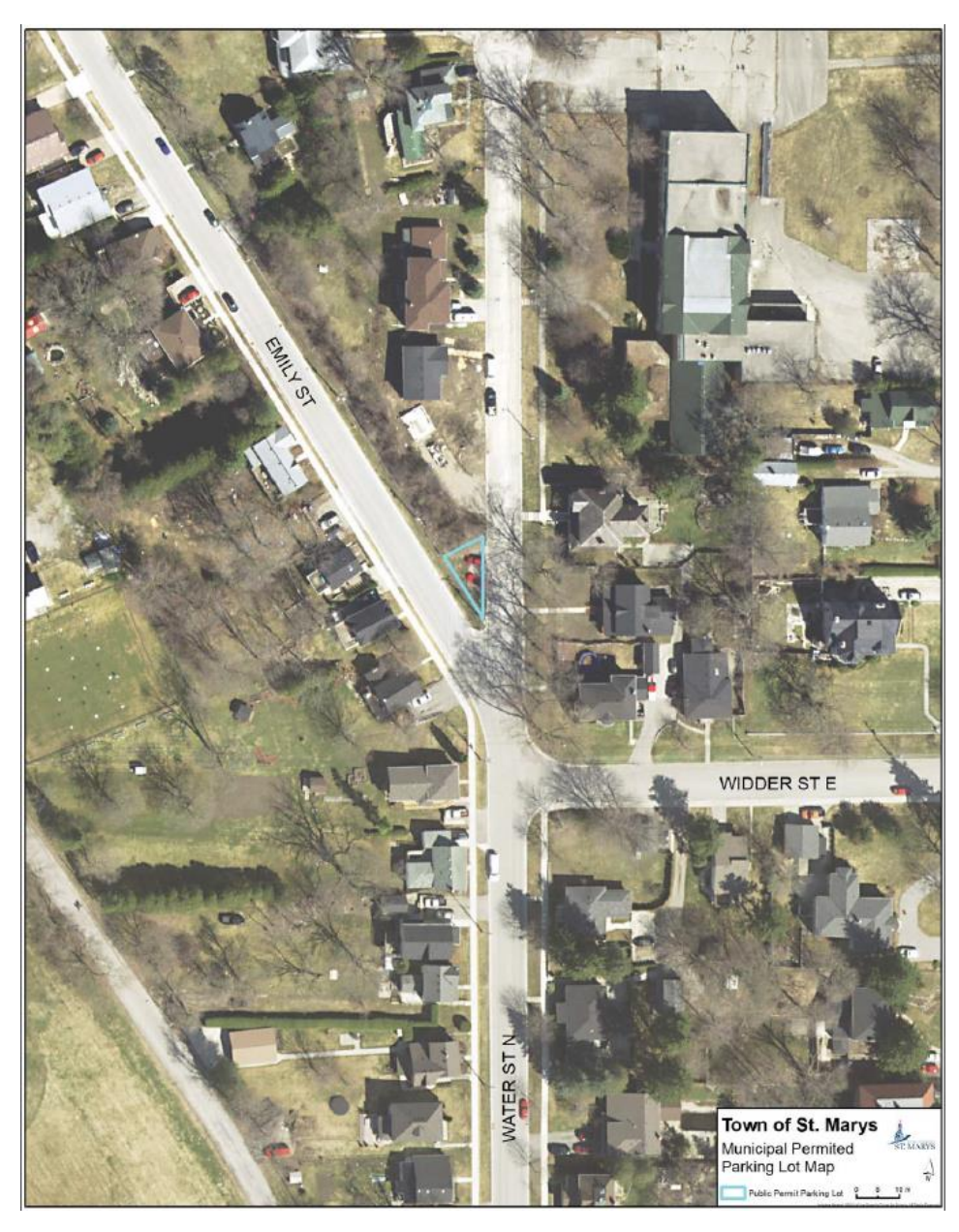
Schedule 17 DESIGNATED PERMIT ONLY PARKING LOTS

1. Water St. N. for residents of Water St. N by permit only